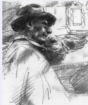
The sketch that inspired the iconic statue